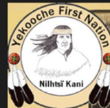
YEKOOCHE FIRST NATION