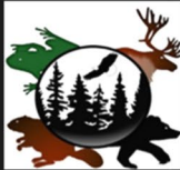
BURNS LAKE BAND